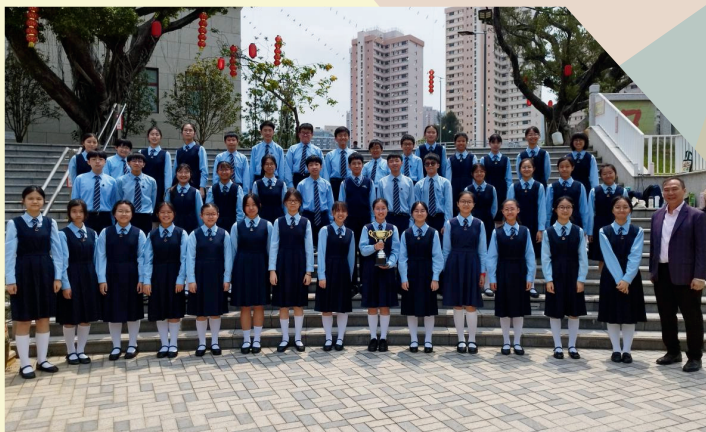
Choir members stand proud with the JSMA Gold Award.