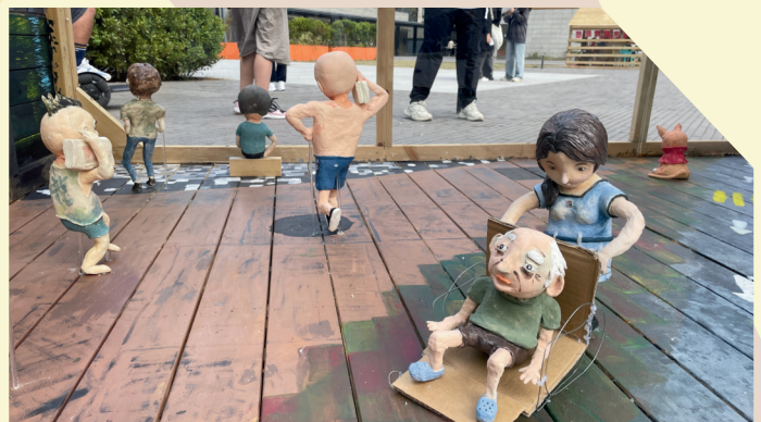
Creative student artwork on display at Kai Tak Station Plaza.

A total of six S4 and S5 students joined the Kowloon City Youth Arts Festival, an event that connected them with the wider community. Under the tutelage of professional artists, students spent half a year creating and perfecting their ceramic artworks. They not only had the chance to display their artistic talent in an exhibition, but they also shared their passion for art with the general public in workshops. It was a great opportunity for them to contribute to the community!