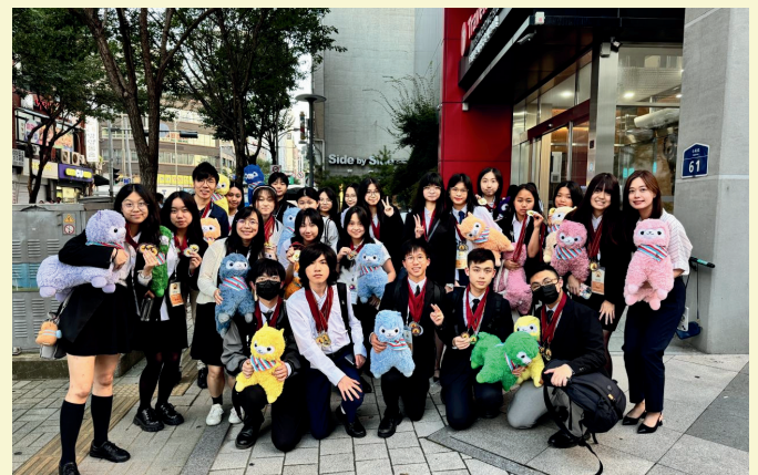
Our world-class debaters pose with the World Scholar's Cup mascot in Seoul, South Korea.

Following their triumph at the Hong Kong Regional Round of the World Scholar's Cup, Hoi Ping debaters battled it out in the Seoul Global Round and furthered their success. Twenty-three students from our school qualified for the competition in South Korea and came away from the event with a total of 60 awards, helping them secure a place at the final World Scholar's Cup at the prestigious Yale University, where they will have the unique chance to interact with students from around the world and put their sharp debating skills to the ultimate test!