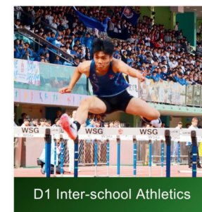
D1 Inter-school Athletics