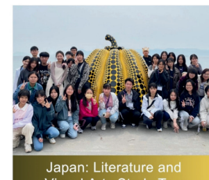
Japan: Literature and Visual Arts Study Tour