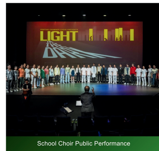
School Choir Public Performance