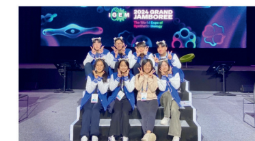
Paris, France: iGEM Competition