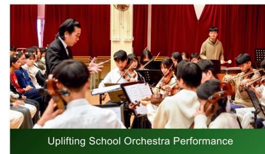
Uplifting School Orchestra Performance

Hoi Ping provides platforms for students to shine in sports, dance, music and visual arts. They have displayed their talents on many occasions.