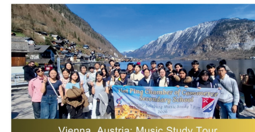
Vienna, Austria: Music Study Tour