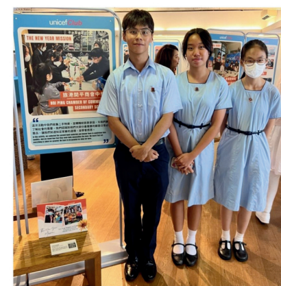
UNICEF Club Outstanding Project