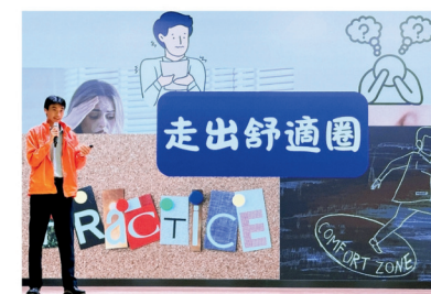
Inspirational Student Sharing