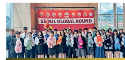
Seoul, South Korea: World Scholar's Cup – Global Round

We nurture students into informed citizens adaptive to the latest developments in our world. Therefore, our study tours do not simply bring education outside the classroom, but also to intellectual heights that motivate further learning.