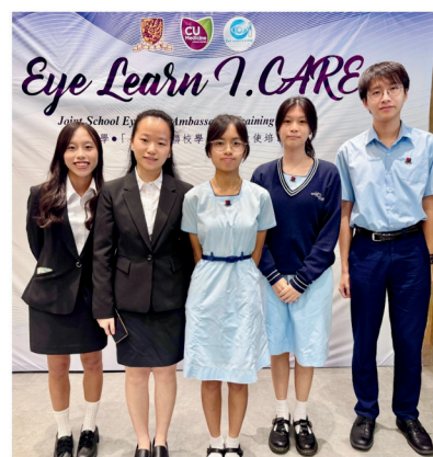
Eye Hospital Volunteering