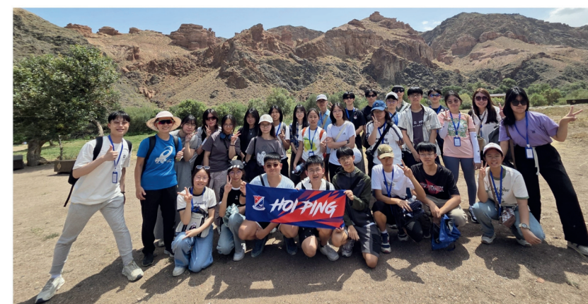
Kazakhstan: Geography and Culture Study Tour