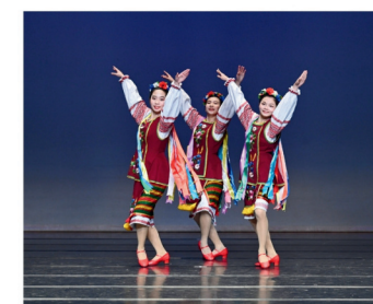
Award-winning Dance Team