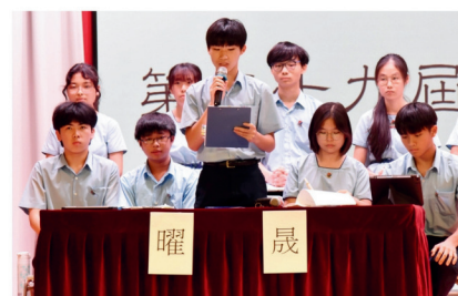
Students' Union Election

Our school emphasises values education to nurture role models and future leaders. Our students serve the local community and collaborate with charitable organisations, ultimately inspiring them to live a purpose-driven life.