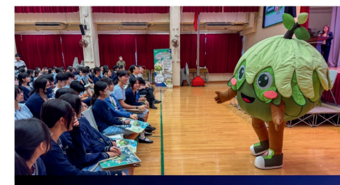
Social Enterprise Sharing