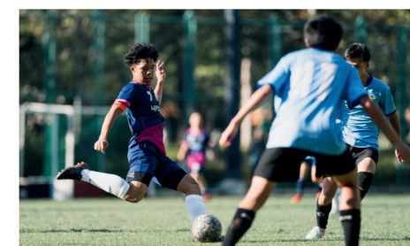
Inter-school Football Champions